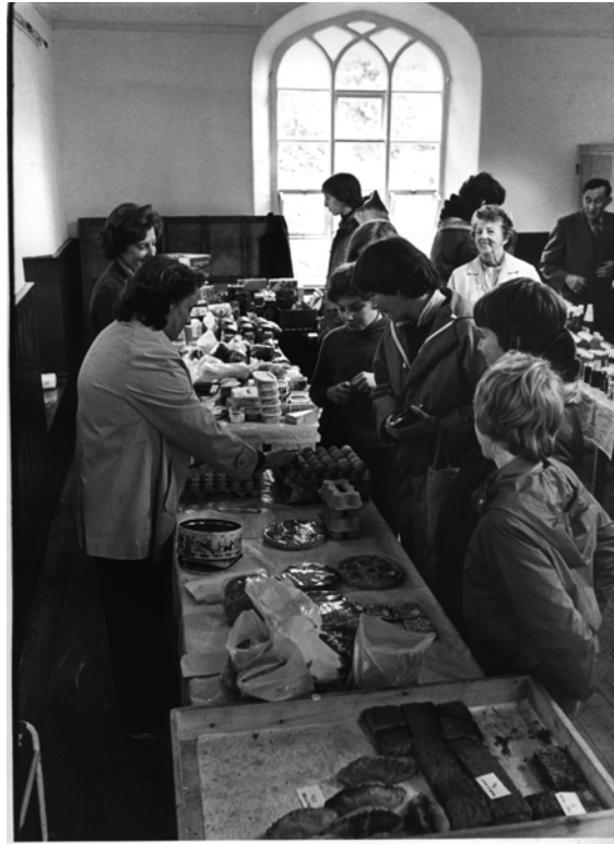
Brentor Community Shop in the 1980s. This venture was run by the Villagers in the Church Hall and served Brentor for 15 years from 1978.