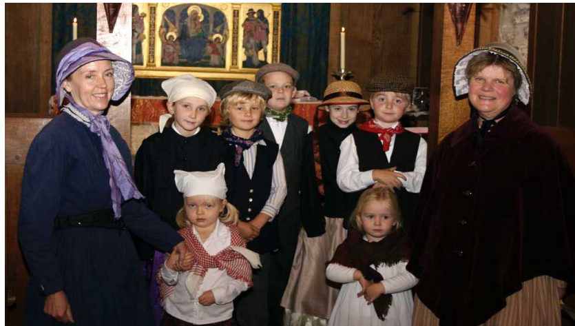
Photo taken at the Christchurch 150th Anniversary